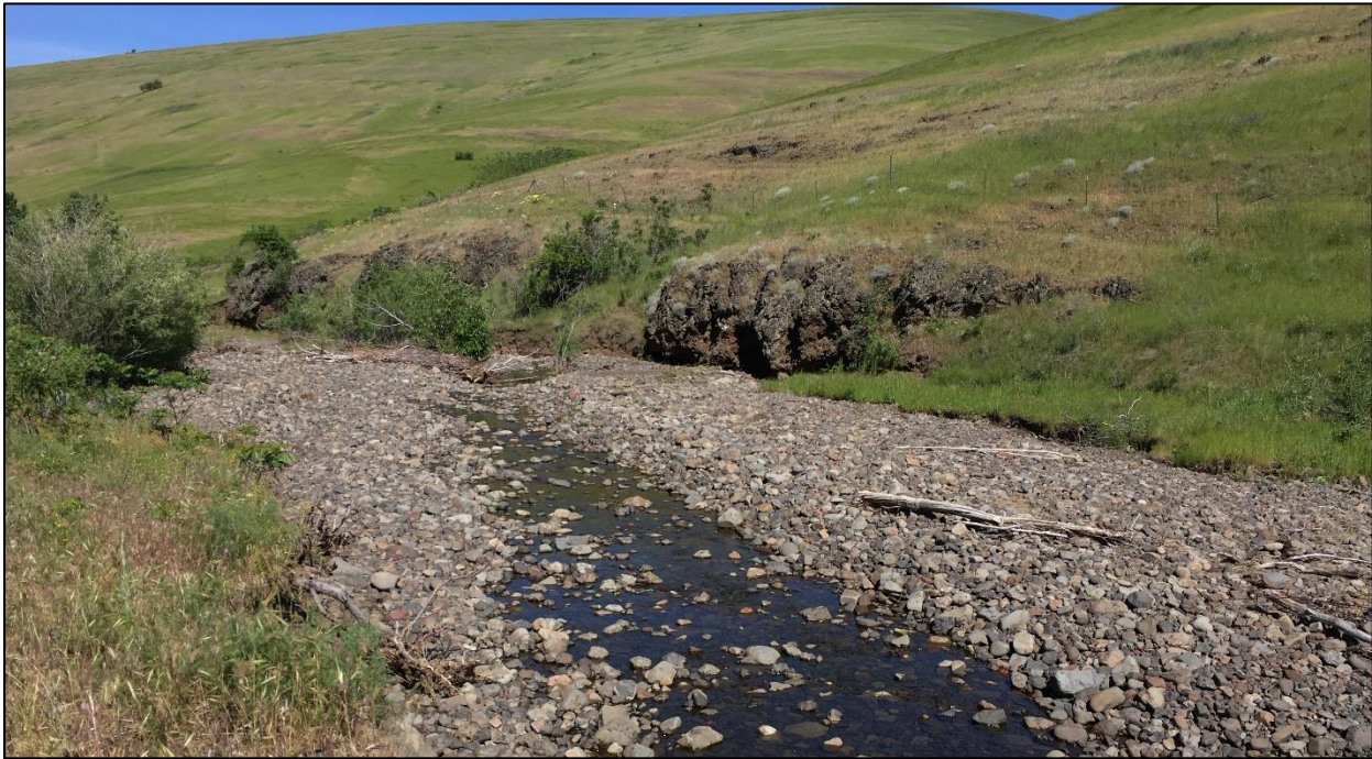
Surface flow rates drop and water goes subsurface in May/June. This image looks downstream at the channel and south-facing hillslope.