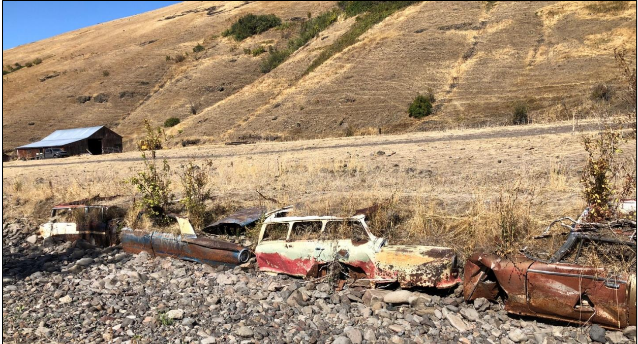
Above: Looking north across Couse Creek at car bodies in the bank and the dry floodplain near Scott Canyon, at the lower boundary of the project reach.