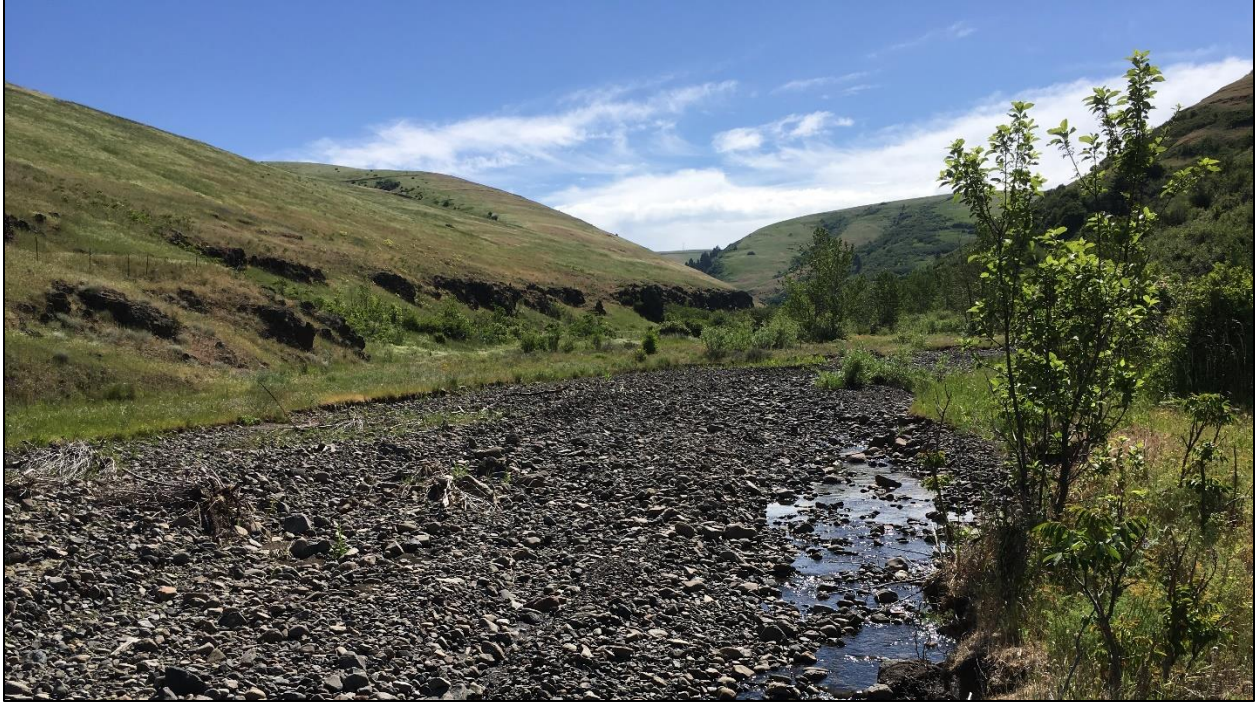
Looking upstream Couse Creek, floodplain, and the south-facing hillslope.