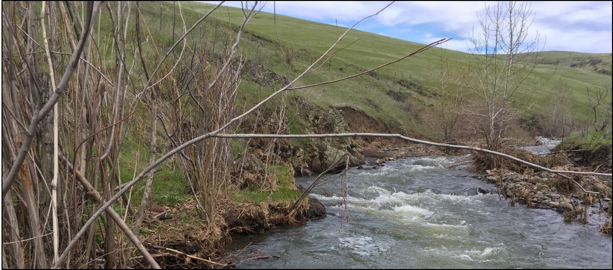
Wintertime flow within the project reach, looking upstream.