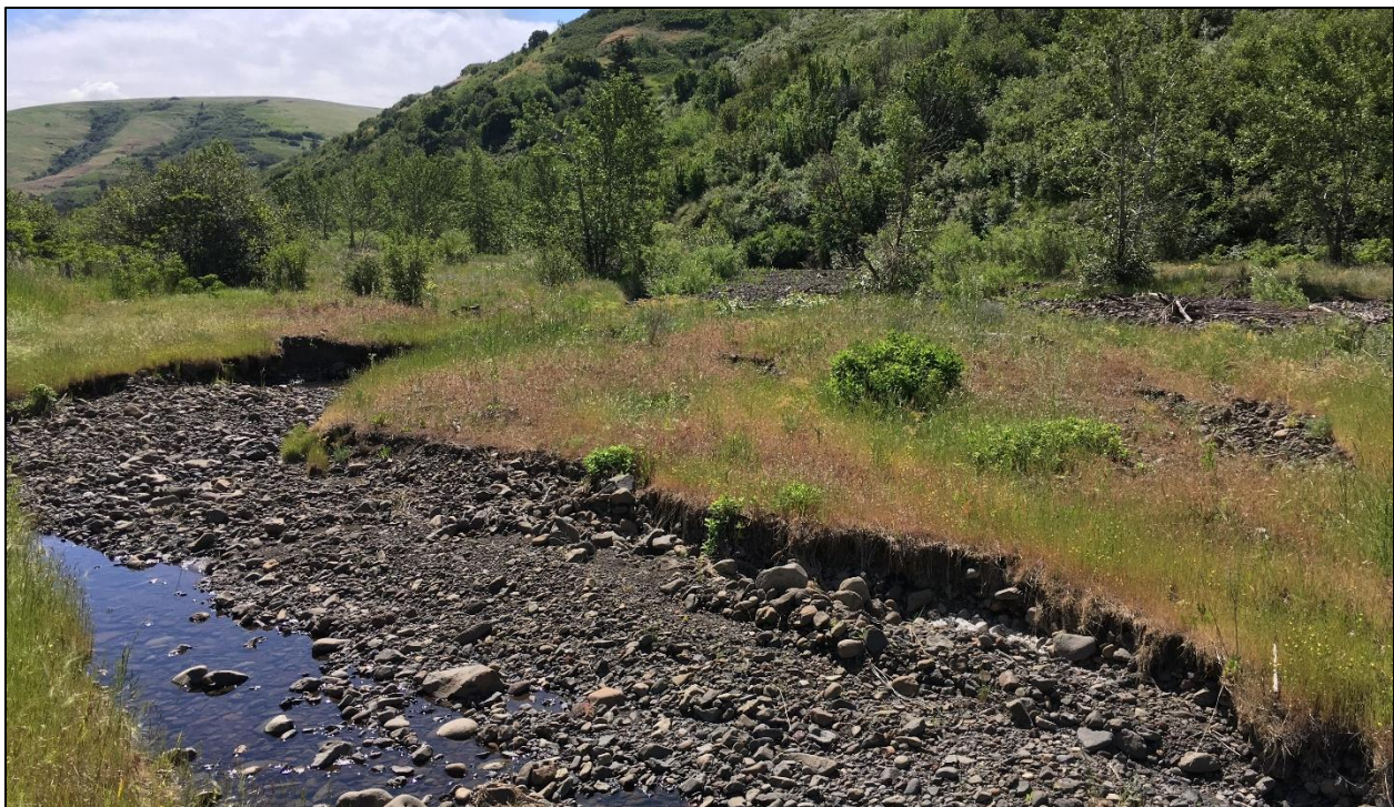
Looking upstream at Couse Creek, the floodplain, and north-facing hillslope during low flow conditions in late spring.